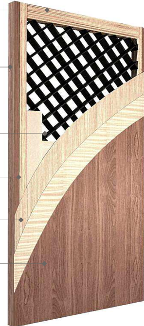
510 HC / IHC

Warranty: One year limited . See Vancouver Door Warranty.